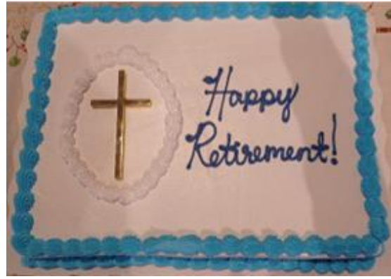
Just the beginning of a well-deserved retirement